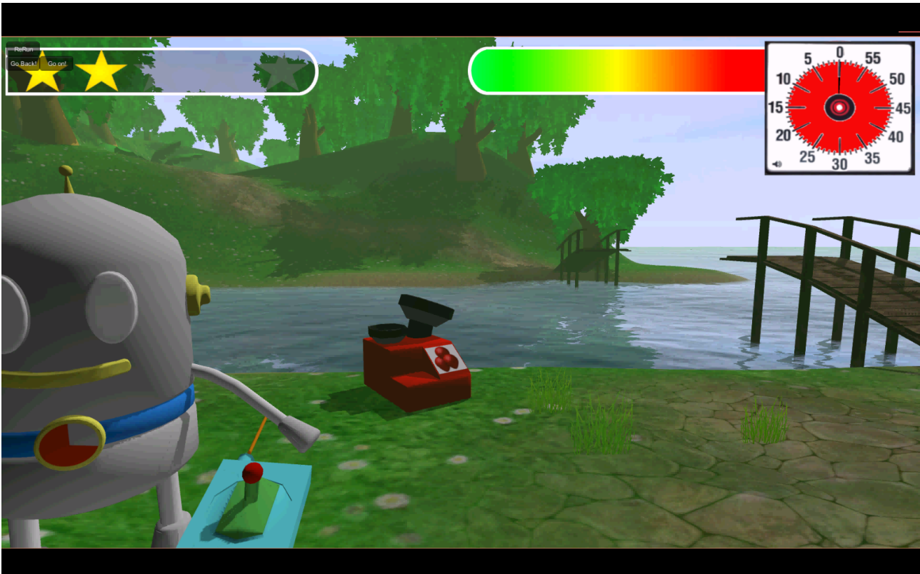
Figure 6. Screenshot of the mini-game Balloon (time perception).