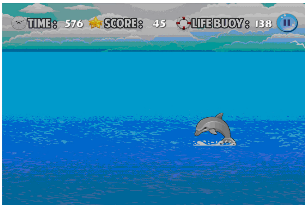
Figure 1. Screenshot of Lifeguard .

To better understand the physiological mechanism behind eye movement, real-time biometric measurement is used to monitor the participants while playing the video game. We recorded brain activity using 64 electrodes during the duration of game play, allowing us to track what eye movements stimulate the brain and what kind of brainwaves are being produced.